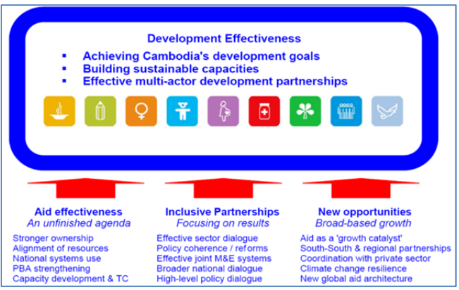
Figure 1.Defining development effectiveness in Cambodia