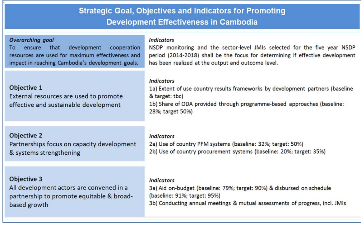
Figure 5. Proposed monitoring arrangements

During discussion, the following points were raised: